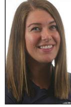
SR • DS