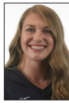
SR • MB