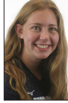
JR • OH