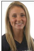
JR • L