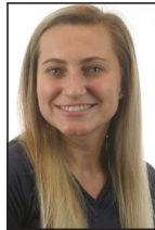
JR • OH