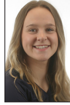
SR • DS