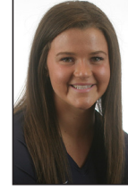
FR • OH