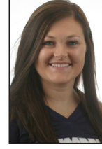
JR • DS