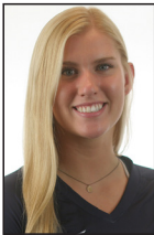
JR • S