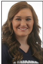
SR • S