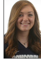
SO • OH