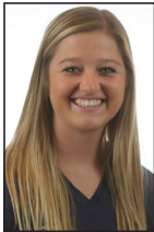
SO • DS