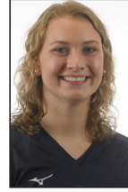
SO • MB