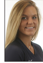
SO • OH