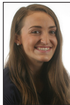
SO • RS