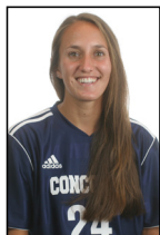
JR • MF