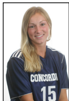
JR • F