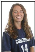
SR • D