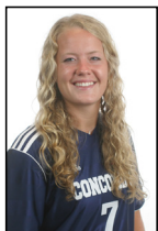
SR • D