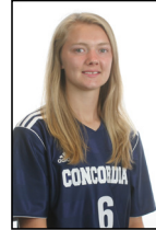
FR • MF