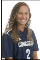
FR • D