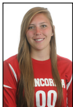
JR • GK