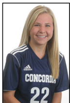
SR • F