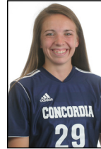
SR • D