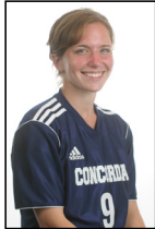
FR • F