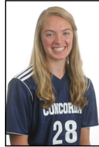
FR • D