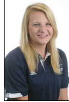
Grad Asst. Coach