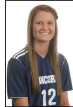
FR • F