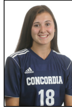
SO • D