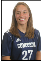
SO • D