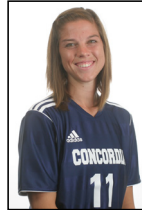
SR • MF