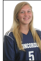
FR • D