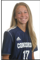
SR • F