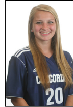
JR • D