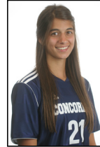
FR • D