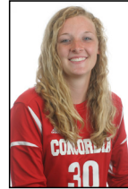
SO • GK