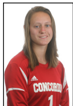
JR • GK