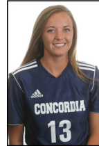
SO • F